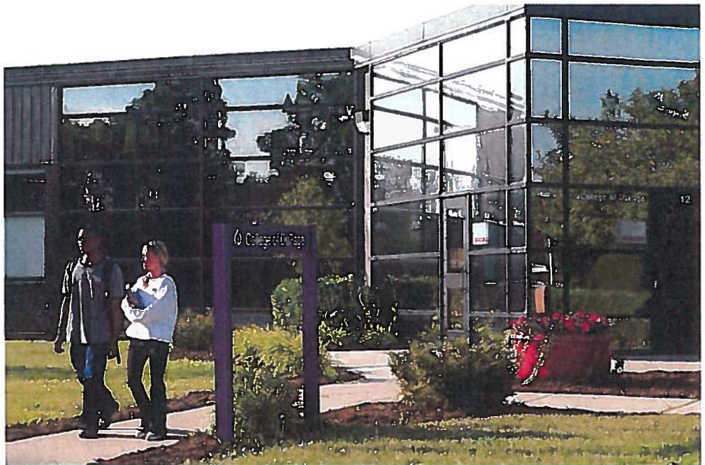
College of DuPage Addison Center

Please note: Hours are subject to change.