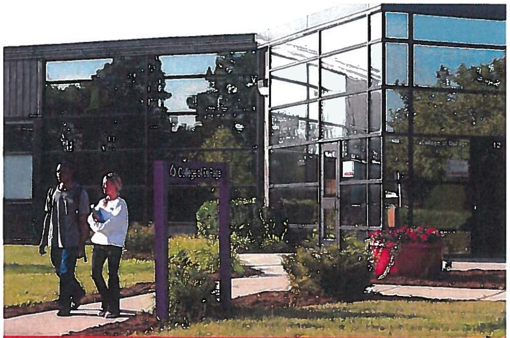
College of DuPage Addison Center

Please note: Hours are subject to change.