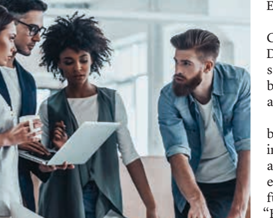
Innovation DuPage will connect small businesses with the necessary resources to thrive while providing new owners with the tools to succeed.

"The Kaufman Index of Growth Entrepreneurship ranks Illinois 17th among the top 25 most populous states," he said. "Greater DuPage has a diverse industry base, venture capital is strong, and yet we have to