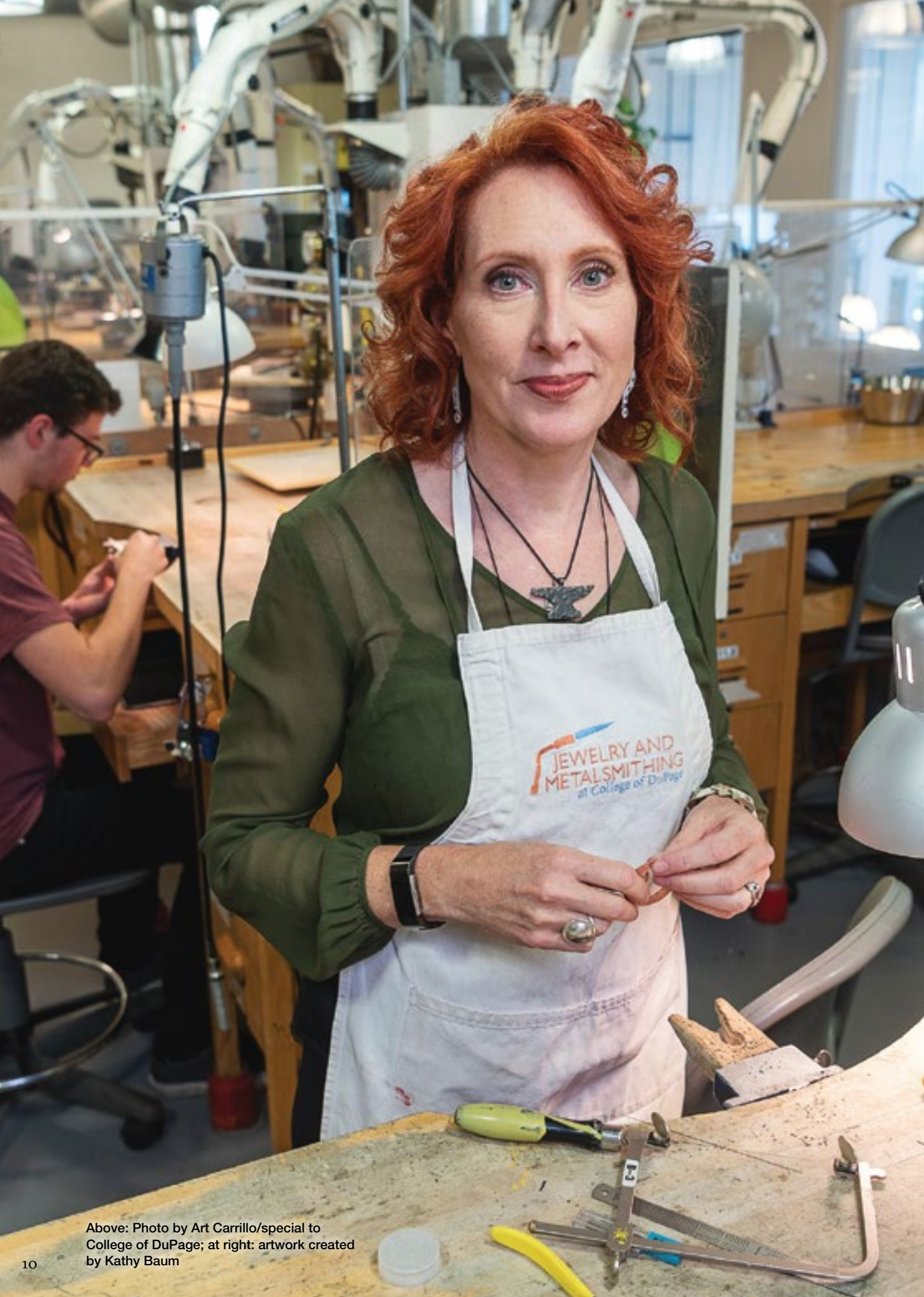
Above: at right: artwork created by Kathy Baum