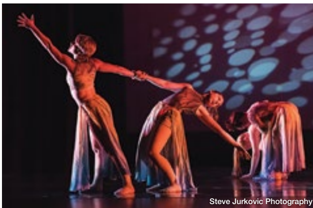
Students in the Dance program perform works by COD faculty, guest choreographers and selected student choreographers.

“I was lucky to have experiences early on in my development, which gave me the confidence to keep going,” she said. “When you find something that makes you so happy and stimulates your intellect—and you feel you have something to contribute—it’s impossible to resist.”